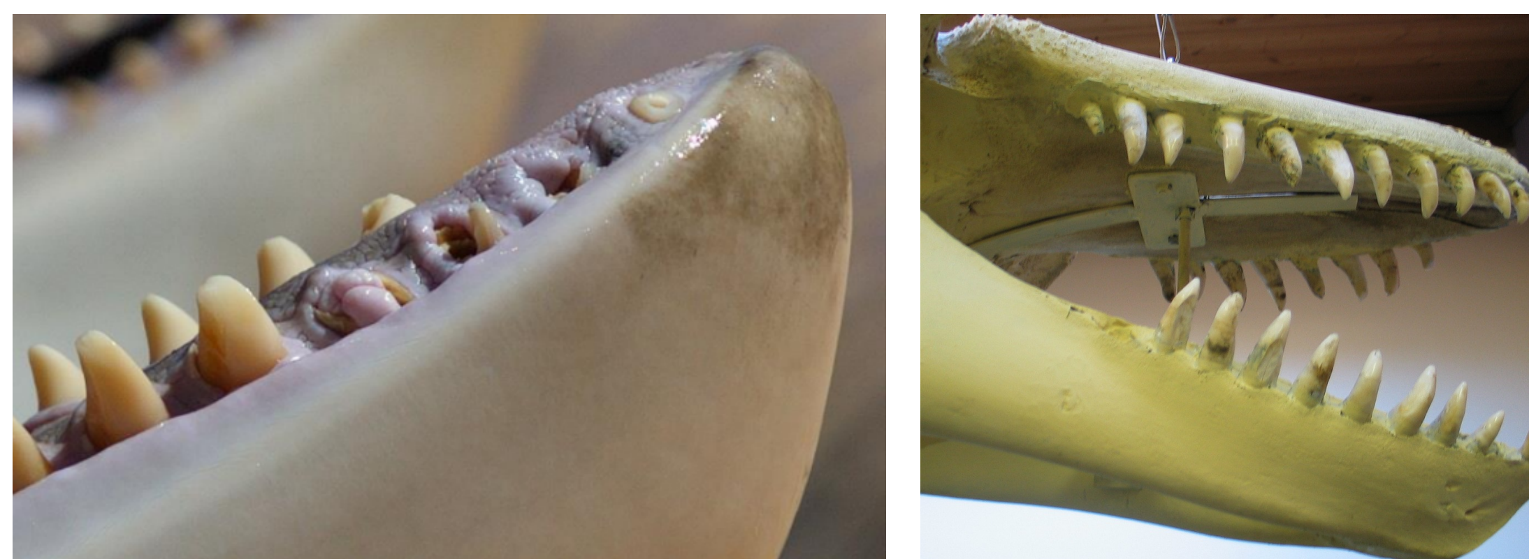
Right: Skull of free-ranging orca showing normal teeth. Left: One particularly notable behavioral abnormality in captive orcas is the grating of the teeth on hard surfaces until they are broken or worn down close to the gum. A recent study (Jett, J., Visser, I.N., Ventre, J., Waltz, J. and Loch, C., 2017. Tooth damage in captive orcas ( Orcinus orca ). Archives of Oral Biology , 84:151-160.) found that over 60% of captive orcas in the USA and Spain have fractured mandibular teeth and 24% exhibited "major" to "extreme" mandibular coronal tooth wear down to the gingiva. This condition increases vulnerability to systemic infections and the teeth must be drilled out and regularly flushed.

Prolonged stress results in chronically elevated levels of glucocorticoids (stress hormones), which contribute to neurodegeneration, particularly in the hippocampus, involved primarily in declarative and spatial memory formation, and the amygdala, involved in emotional processing [4]. Animals who lack control over their environment develop learned helplessness (associated with amygdala dysregulation). Under similar conditions, stress in humans is associated with anxiety/mood disorders, major depression, and post-traumatic stress disorder (PTSD). Due to the highly conserved nature of neural structures, the large, complex brains of orcas react similarly to a severely stressful environment, with well-documented behavioral and physiological evidence.