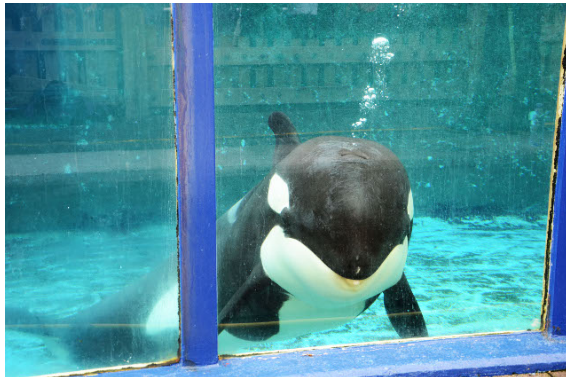
Morgan, an orca held captive at Loro Parque Zoo in Spain. She was captured off the Dutch coast in 2010 under a "rescue, rehabilitation and release" permit. In 2018, she gave birth to a calf named Ula. Morgan engages in stereotypies, including repeatedly banging her head against a metal gate.